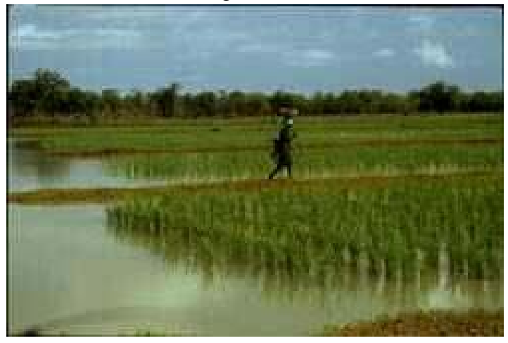
Woman walking between mangrove rice fields. http://www.cirad.fr/en/actualite/communique.php?annee=2005&id=268

the tide "goes out" fresh water flows from the river into the ocean. When the tide "comes in" salt water flows from the ocean into the river. Salt water will kill rice plants. Therefore farmers have built big dirt walls to keep salt out. They rely on the same walls to catch and hold rainwater. The soil is heavy clay and therefore holds the water. The mangrove systems are, amazingly, the most agriculturally productive but require sophisticated water management. Canals, dikes, walls and sluice gates keep the salt water out while retaining the fresh water.